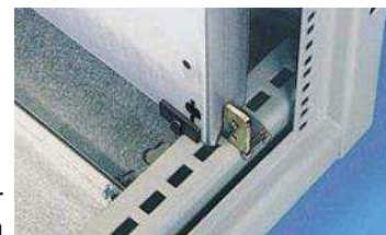
Plastic sliders on rails for easy movement at bottom